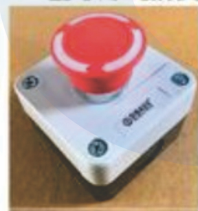
Emergency Pit Switch