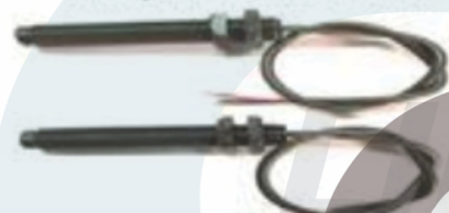
ZF TVS—Reed Switch